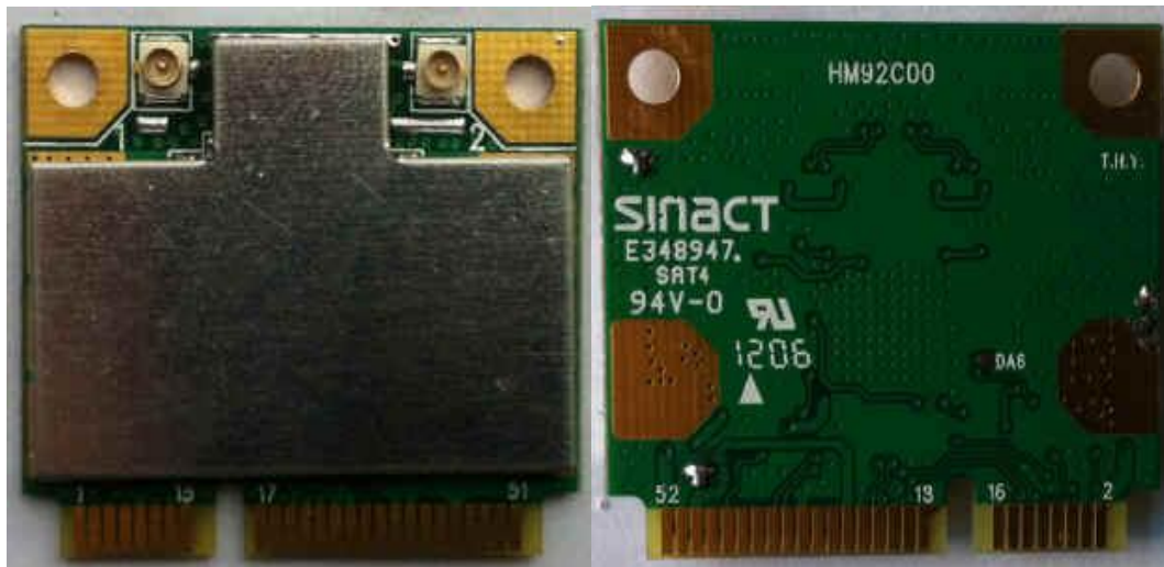
Top and bottom view of NT-8192CE-M